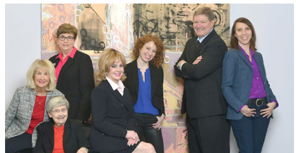
Staff of Clever Crazes for Kids, a project of Building Healthy Lives Foundation